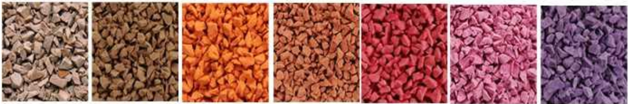
TPV 7 Light brown