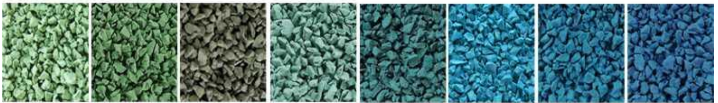
TPV 14 Light green