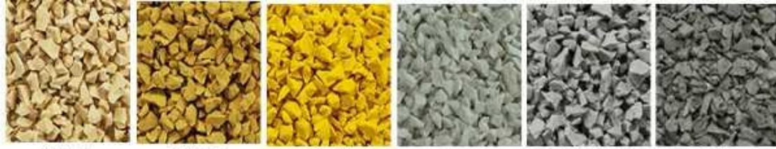
TPV 1 Eggshell

Sports Flooring Systems & Building Materials 50 YEARS OF EXPERIENCE