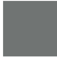
RAL 7037 Dusty Grey