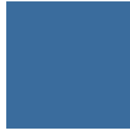
RAL 5015 Sky Blue