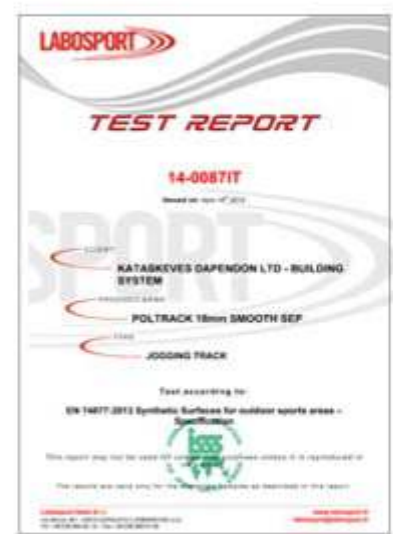
POLTRACK JOGGING TRACK