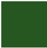
RAL 6002 Leaf Green

Sports Flooring Systems & Building Materials 45 YEARS OF EXPERIENCE