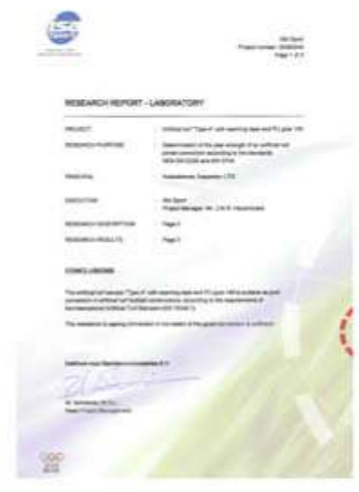
PU GRASS 149