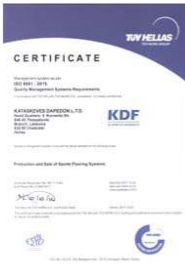
ISO KDF Ltd