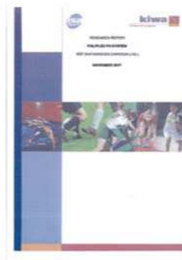
BADMINTON POLYFLEX PU