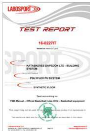
FIBA POLYFLEX PU