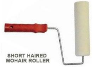
SHORT HAIR MOHAIR ROLLER