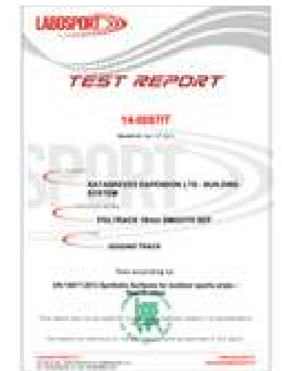
POLTRACK JOGGING TRACK