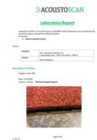
POLTRACK SANDWICH EN 14877