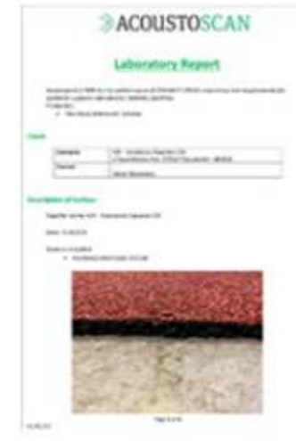
POLTRACK SPRAYCOAT EN 14877