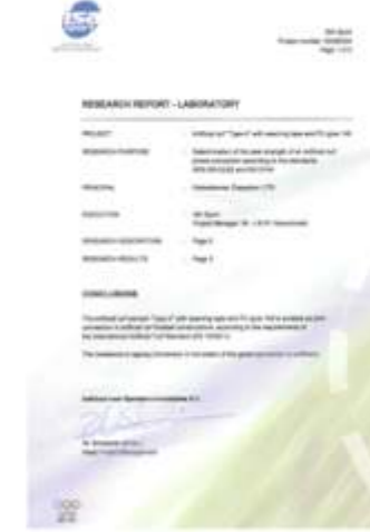
PU GRASS 149