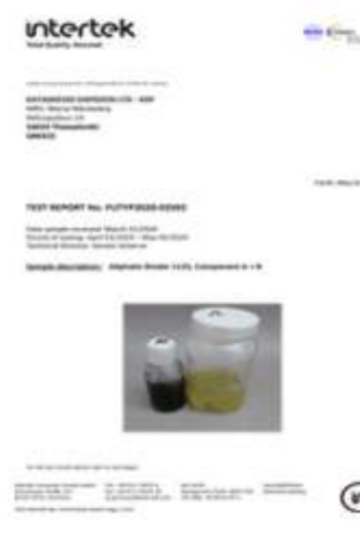
PAH TEST REPORT PU BINDER 1125 AL