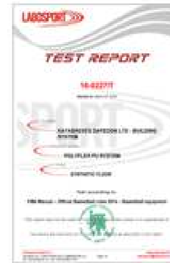
FIBA POLYFLEX PU