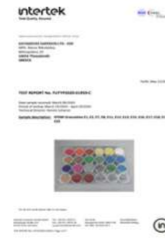
PAH TEST REPORT EPDM 856