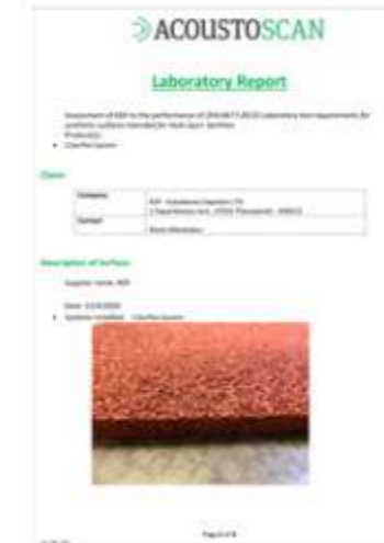
COLORFLEX EN 14877