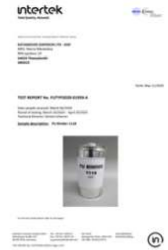
PAH TEST REPORT PU BINDER 1118