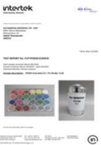
PAH TEST REPORT PU BINDER plus EPDM 856