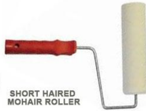
SHORT HAIRED MOHAIR ROLLER